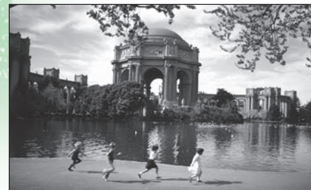
(Above) Palace of Fine Arts. (Background) Night Skyline. San Francisco photos courtesy of SFCVB by Phil Coblenz.

The new Fellows Orientation Program will be held on the afternoon of Thursday, September 27. The Convocation will be on Friday afternoon, September 28. Candidates will report to the robing room an hour prior to the ceremony. On that evening, following the Convocation, there will be a reception honoring the new inductees followed by the annual gala dinner dance which is black tie optional and always well attended.